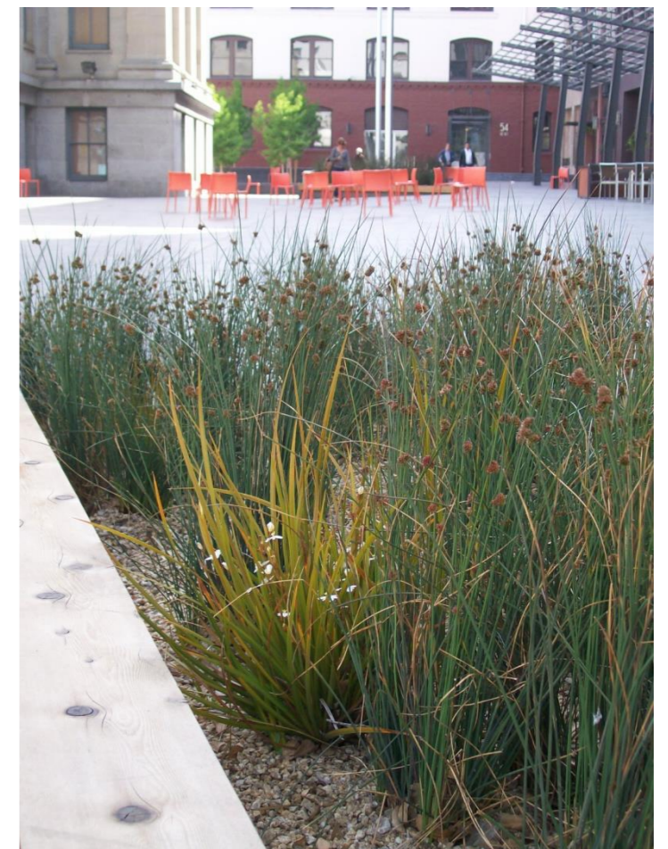
Stormwater Design Guidelines