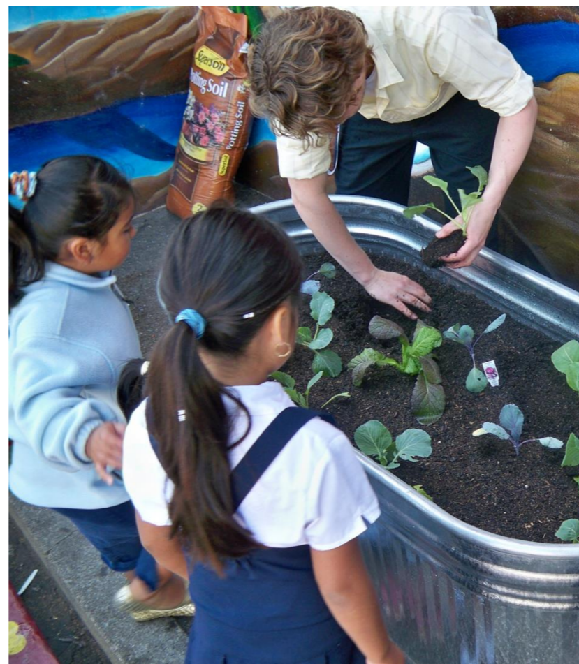
Education, Grants, and Incentives