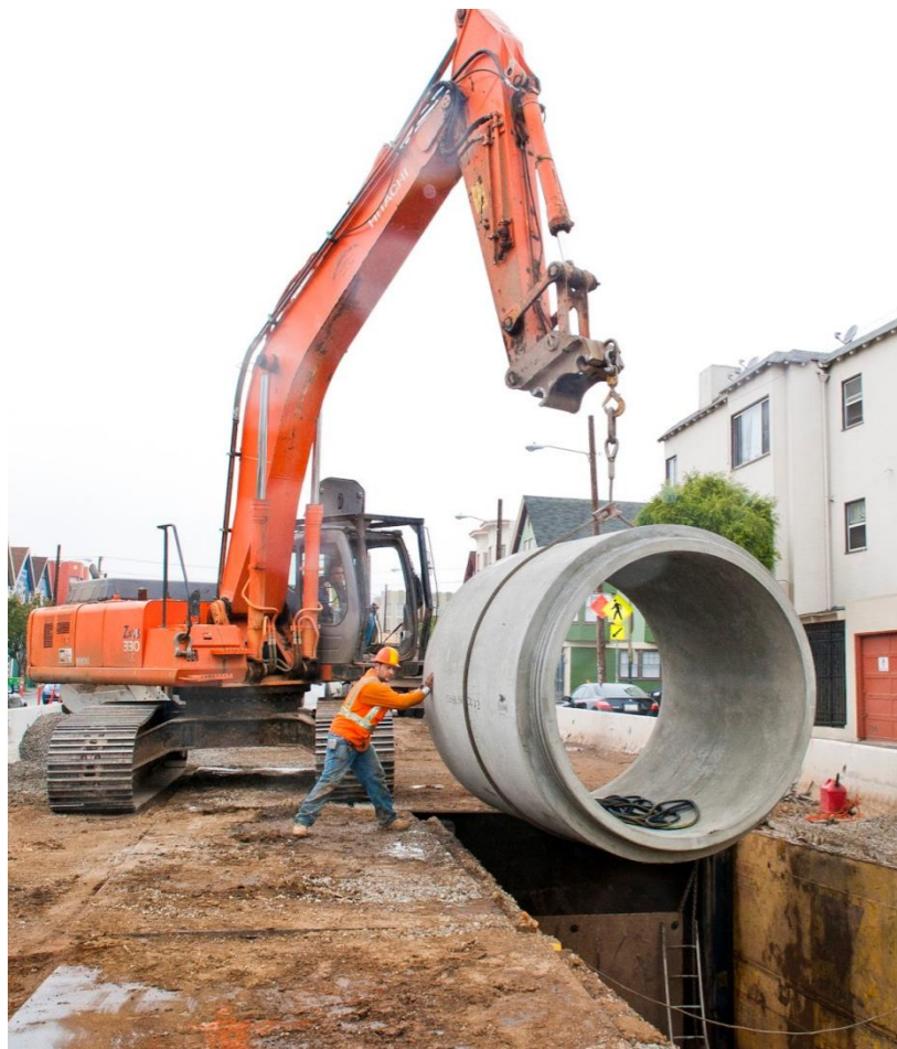
Green and Grey Infrastructure